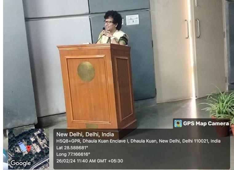
New Delhi, Delhi, India H5Q8+GPR, Dhaula Kuan Enclave I, Dhaula Kuan, New Delhi, Delhi 110021, India Lat 28.588681° Long 77.166616° 26/02/24 11:40 AM GMT +05:30