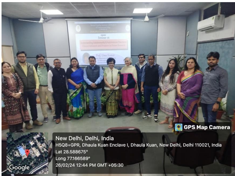
New Delhi, Delhi, India H5Q8+GPR, Dhaula Kuan Enclave I, Dhaula Kuan, New Delhi, Delhi 110021, India Lat 28.588675° Long 77.166589° 26/02/24 12:44 PM GMT +05:30