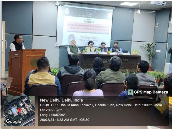
New Delhi, Delhi, India H5Q8+GPR, Dhaula Kuan Enclave I, Dhaula Kuan, New Delhi, Delhi 110021, India Lat 28.58873° Long 77.166706° 26/02/24 11:23 AM GMT +05:30