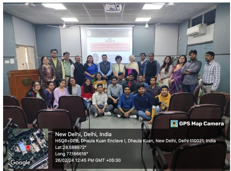
New Delhi, Delhi, India H5Q8+GPR, Dhaula Kuan Enclave I, Dhaula Kuan, New Delhi, Delhi 110021, India Lat 28.588672° Long 77.166618° 26/02/24 12:45 PM GMT +05:30