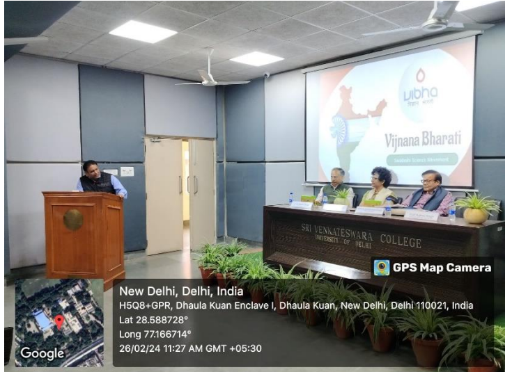
New Delhi, Delhi, India H5Q8+GPR, Dhaula Kuan Enclave I, Dhaula Kuan, New Delhi, Delhi 110021, India Lat 28.588728° Long 77.166714° 26/02/24 11:27 AM GMT +05:30