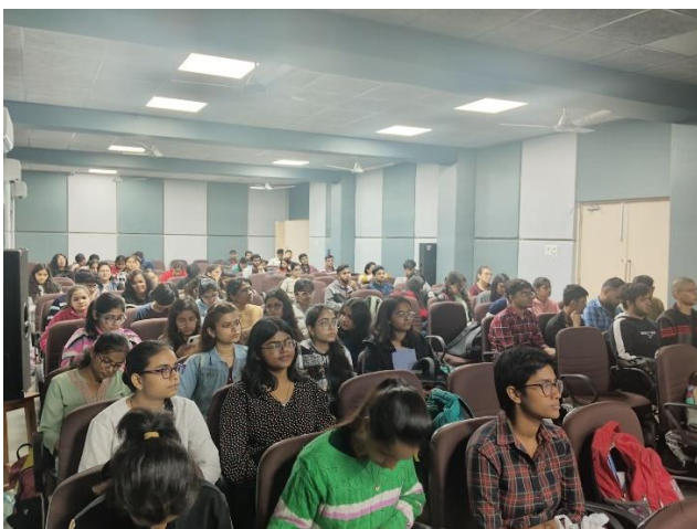
Q & A Interactive session